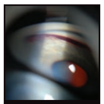
TRAUMA FROM TOY GUN. Goniophoto shows bleeding into the trabecular meshwork and chamber angle after a BB gun injury.

Noting that there are no federal laws regulating nonpowder guns and that